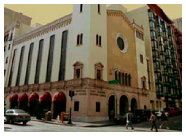
Glide Memorial Church

distributed to Glide clients, many of whom don't have access to these products on a regular basis. Personal products include bar soap, shampoo, lotion, deodorant, toothbrushes, toothpaste, disposable razors, and feminine hygiene products.