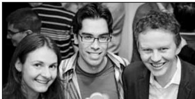
The Co-Founders of CloudFlare